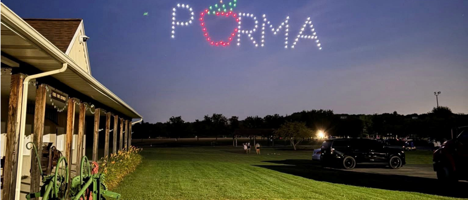
Drone Show at the 2025 Summer Smash - See Page 25 for 2026 Details